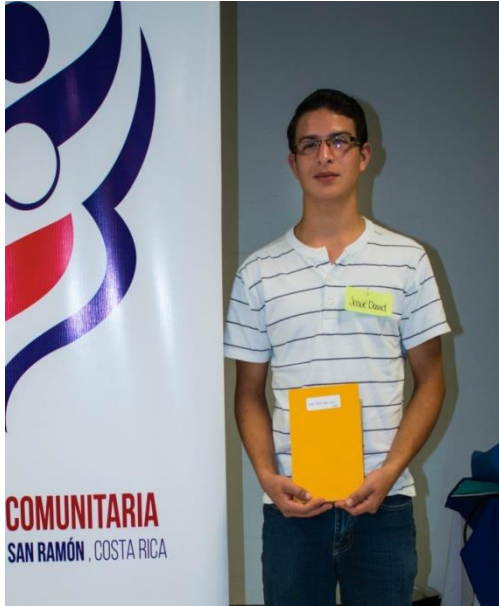
JCS, July 2016 Scholarship Awards

All 23 of the CAA Educational Scholarship students are working hard as they approach the last 8 weeks of the 2016 school year, but our spotlight today is on a quiet, determined 12 th grade student who was raised in the coffee producing mountains west of San Ramon.