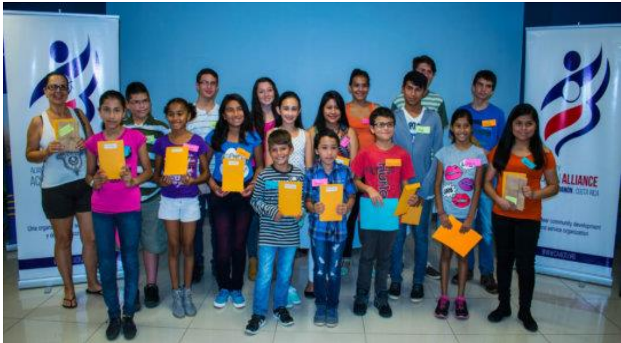
Archive photo of 2016 Awards Presentation, Second Term