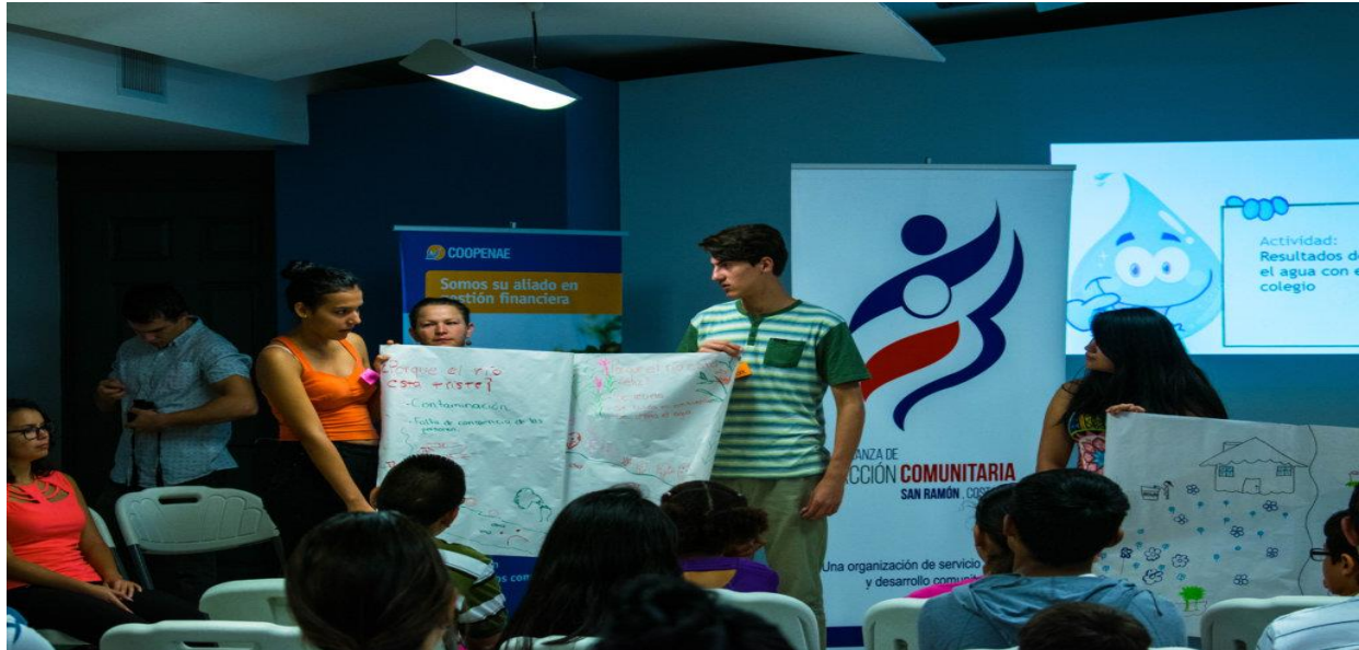
CAA Awards, July 2016 Challenge Session; Student Report on Water Resource Issues

a young level was suggested as the way to build awareness and gradually change wasteful and destructive practices