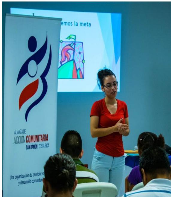
University Program Intern, Leading Challenge Session, 2016 Awards.